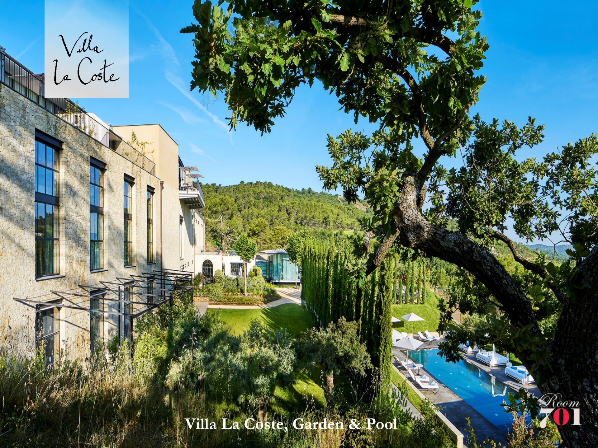
Villa La Coste, Garden & Pool