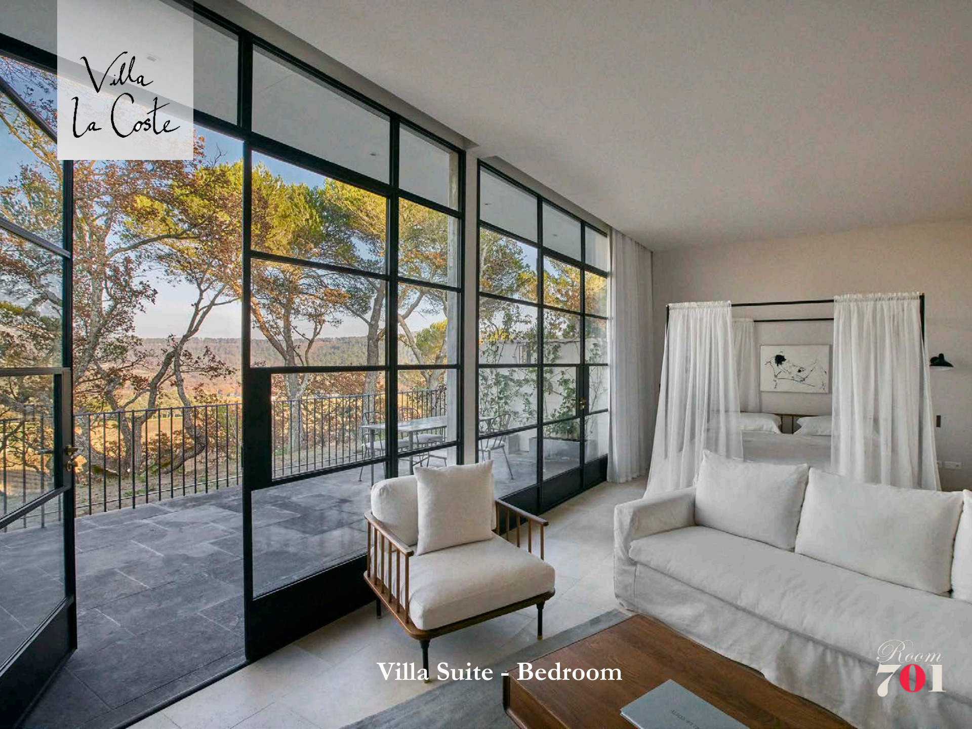
Villa Suite - Bedroom