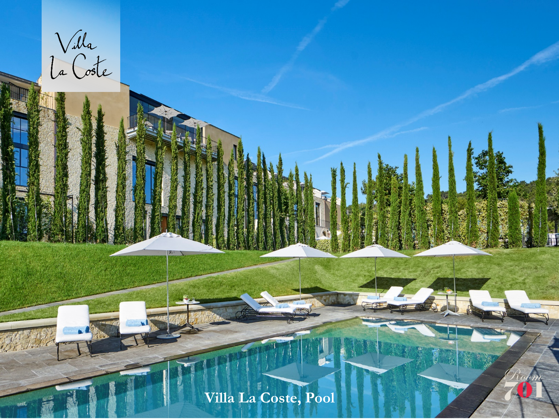
Villa La Coste, Pool