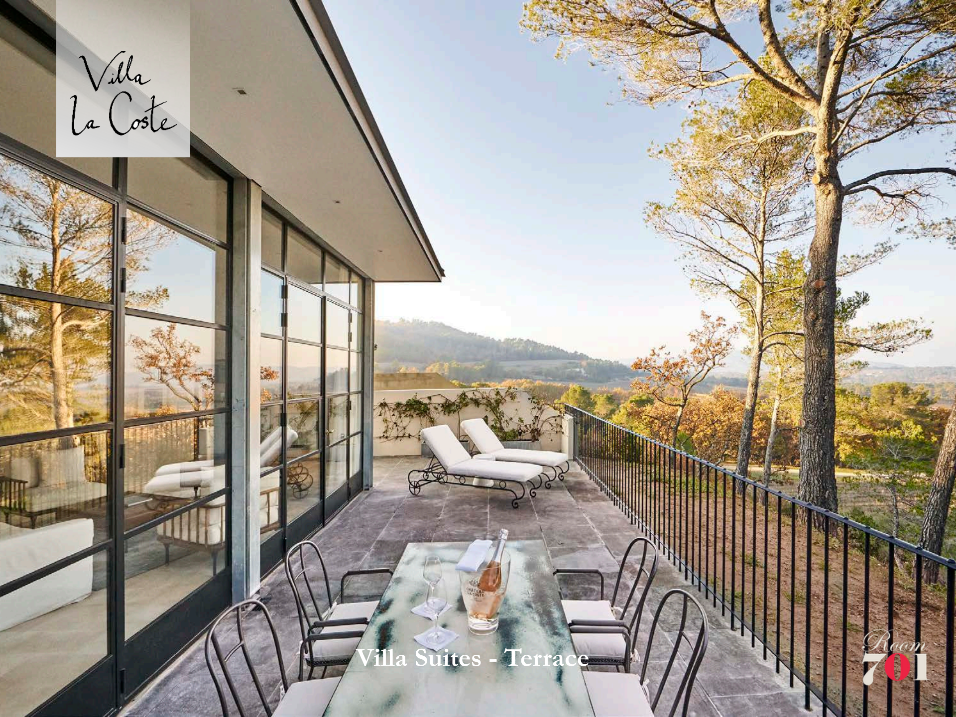
Villa Suites - Terrace