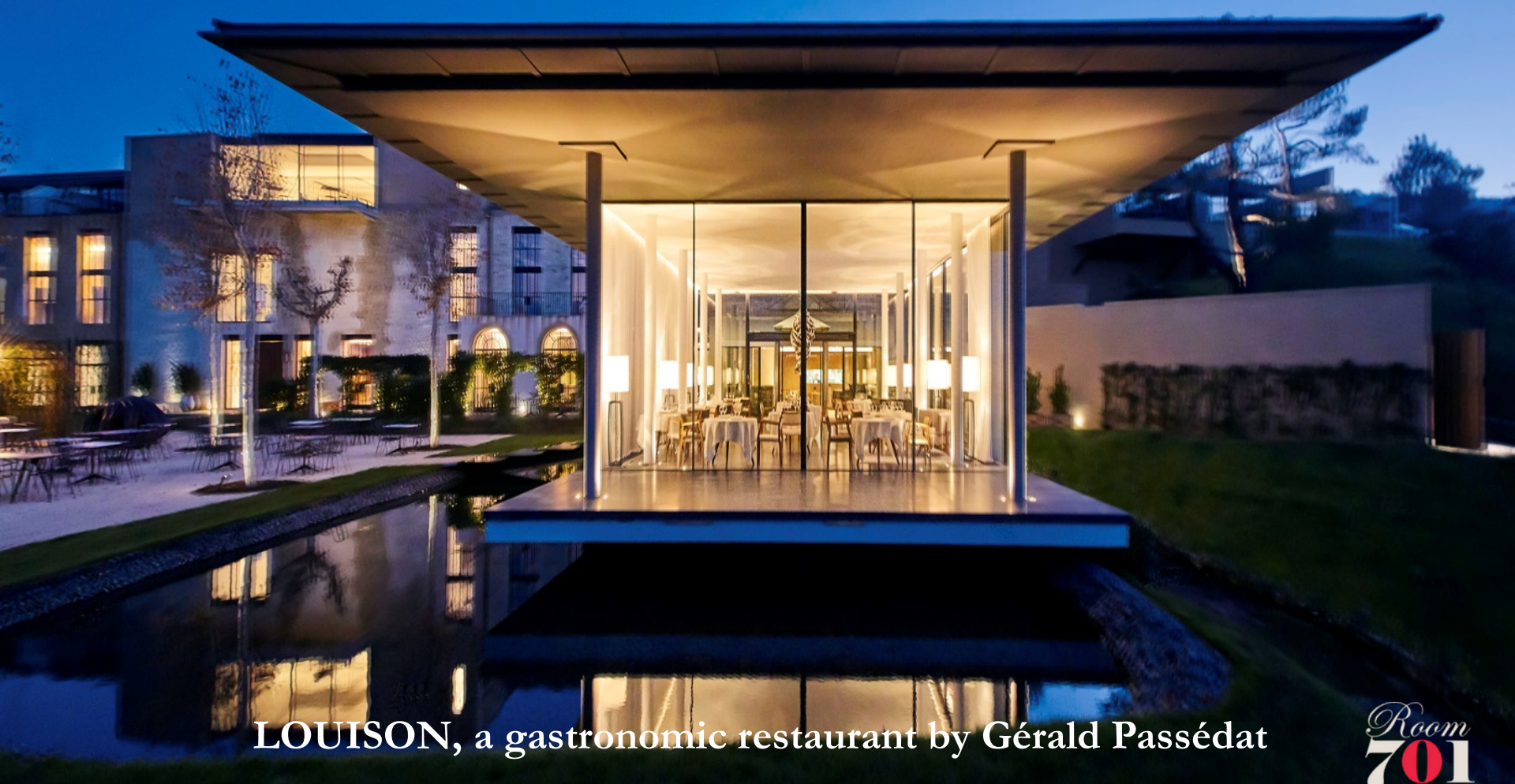
LOUISON, a gastronomic restaurant by Gérald Passédat