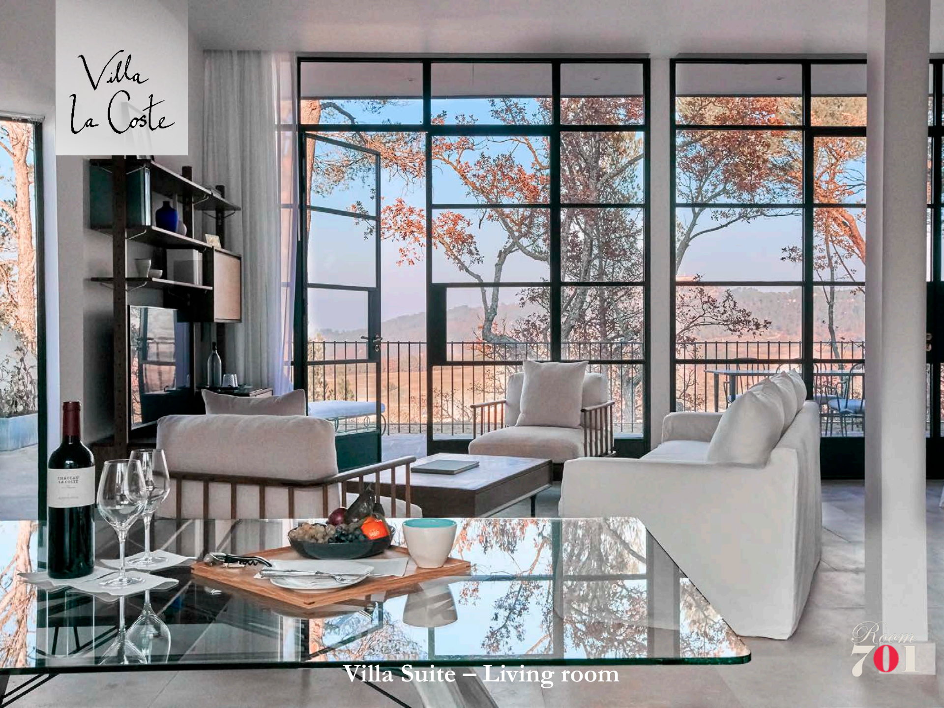
Villa Suite – Living room