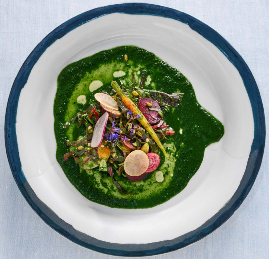
LOUISON , a gastronomic restaurant by Gérald Passédat