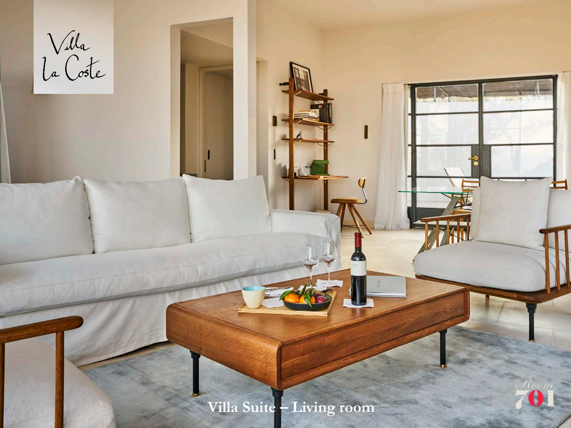
Villa Suite – Living room