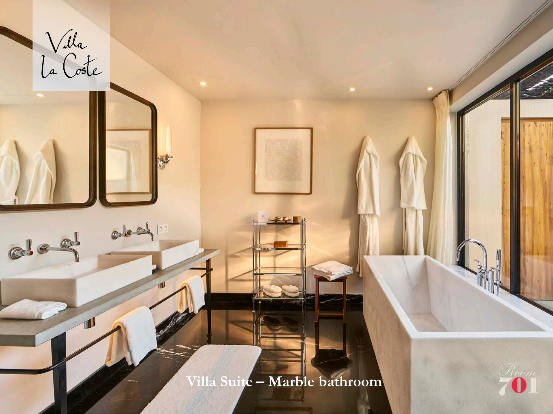
Villa Suite – Marble bathroom