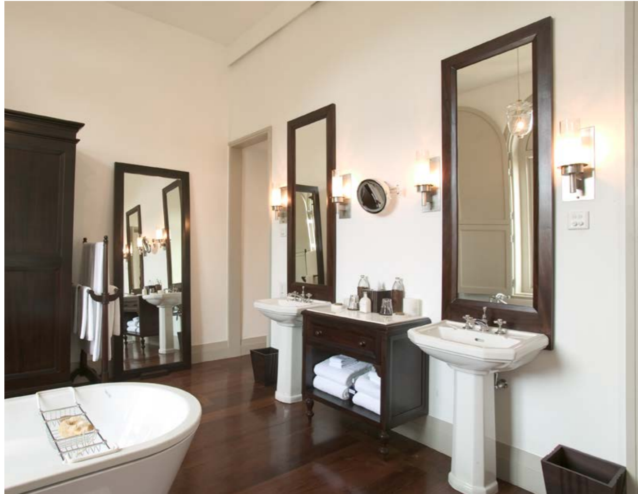
Bathrooms feature twin vanities, a shower, separate water closet and freestanding bathtubs. Hardwood towel stands, framed full-length mirrors and an ample armoire contribute to the genteel ambience.