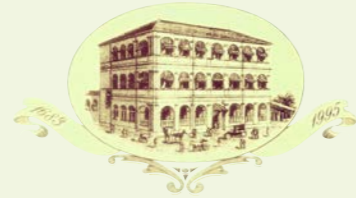
New Oriental Hotel, Galle

Situated within 400-year old Galle Fort — a UNESCO World Heritage Site — Amangalla is housed in historic colonial buildings formerly known as the New Oriental Hotel. The property was founded in 1863 and traded under this name for 140 years.