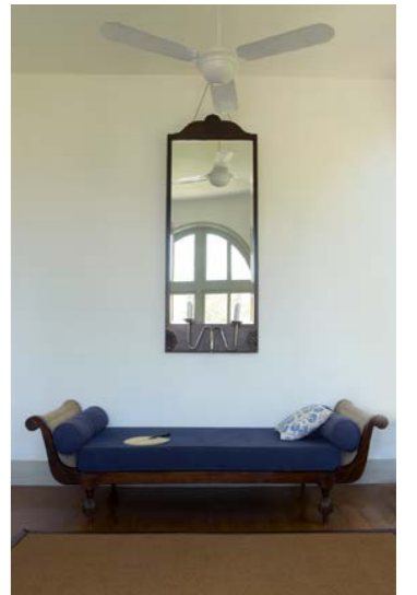
Furnishings also include king-size or twin beds, a writing desk, chaise lounge, planter's chair, dining table and pettagama chest.