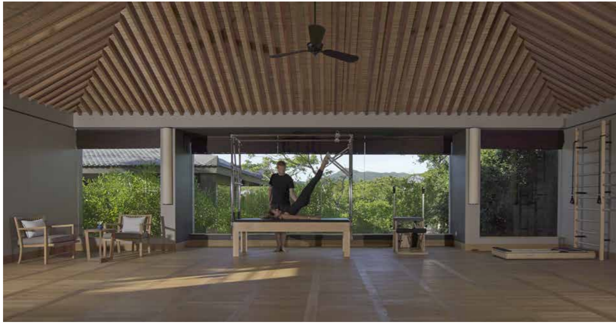
Amanoi's fitness options include a spacious, light-filled gym ( below left ), a Pilates studio ( above and below right ) and the lakeside yoga pavilion ( right ). There are also two outdoor tennis courts and two swimming pools – the Cliff Pool and another at the Beach Club.