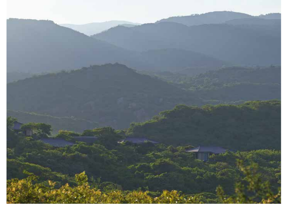
Drawing its name from the Sanskrit-derived word for 'peace' and nơi meaning 'place' in Vietnamese, Amanoi is a tranquil beachside retreat. Embraced by the rolling hills of Nui Chua National Park, the resort overlooks Vietnam's Vinh Hy Bay.