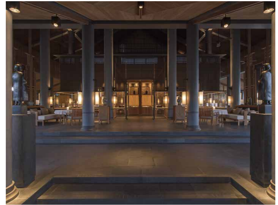
Situated atop a hill at the property's highest point, the Central Pavilion houses a number of relaxation and dining venues.