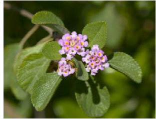
Pool Pavilions feature a 12-metre (40-foot) infinity-edge swimming pool surrounded by teak decking and natural vegetation.