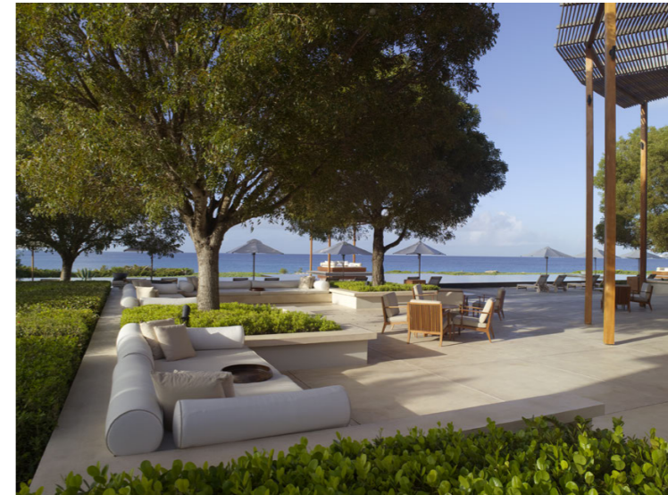
Amanyara (peaceful place) is located on the secluded western shore of Providenciales in the Turks and Caicos Islands. Bordering the pristine reefs of Northwest Point Marine National Park, the resort is a 25-minute drive from the international airport.