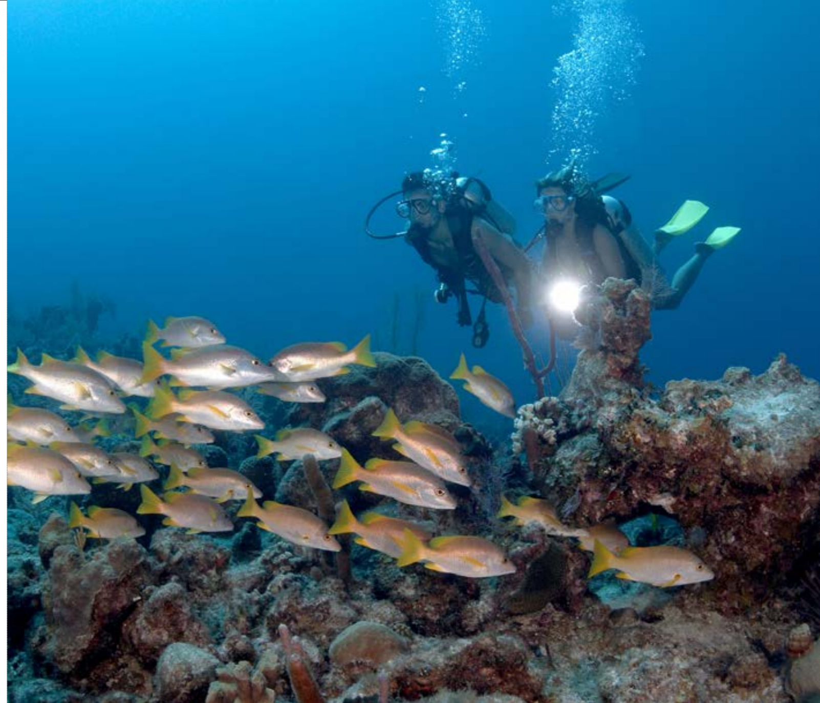
The Turks and Caicos Islands are a premier destination for scuba diving. For certified divers, the resort provides easy access to some of the world's most acclaimed reefs just offshore. Instruction for all levels is also on offer.