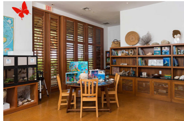
Designed to help guests learn more about nature on the island and the prolific marine life offshore, Amanyara's Nature Discovery Centre provides activities for children and adults alike.