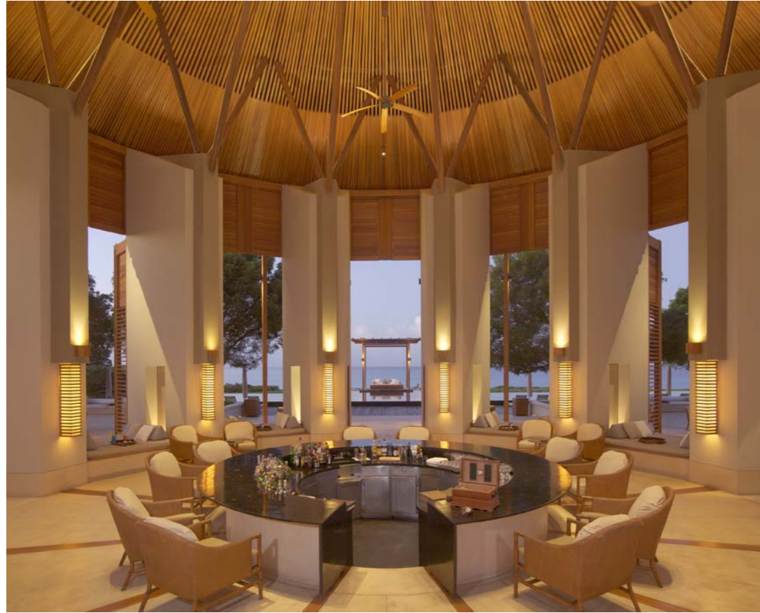
Fronted by the resort's swimming pool, the circular Bar's dramatic conical roof is Amanyara's tallest feature. The Bar's spacious terrace provides informal seating for light lunches, cocktails and post-dinner drinks, while daybeds for lounging fill eight window nooks around the perimeter.