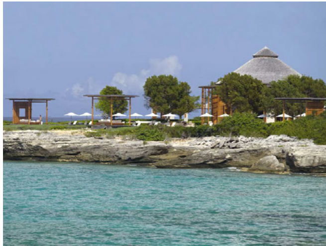
The 50-metre (164-foot) swimming pool offers sweeping ocean views from sun loungers positioned along the timber deck. Salas frame the pool on three sides.