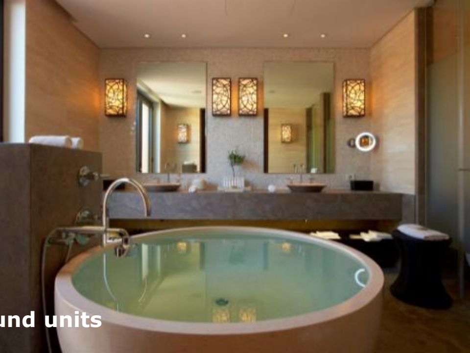
660m 2 Royal Villa Koroni, private infinity pools in almost all ground units