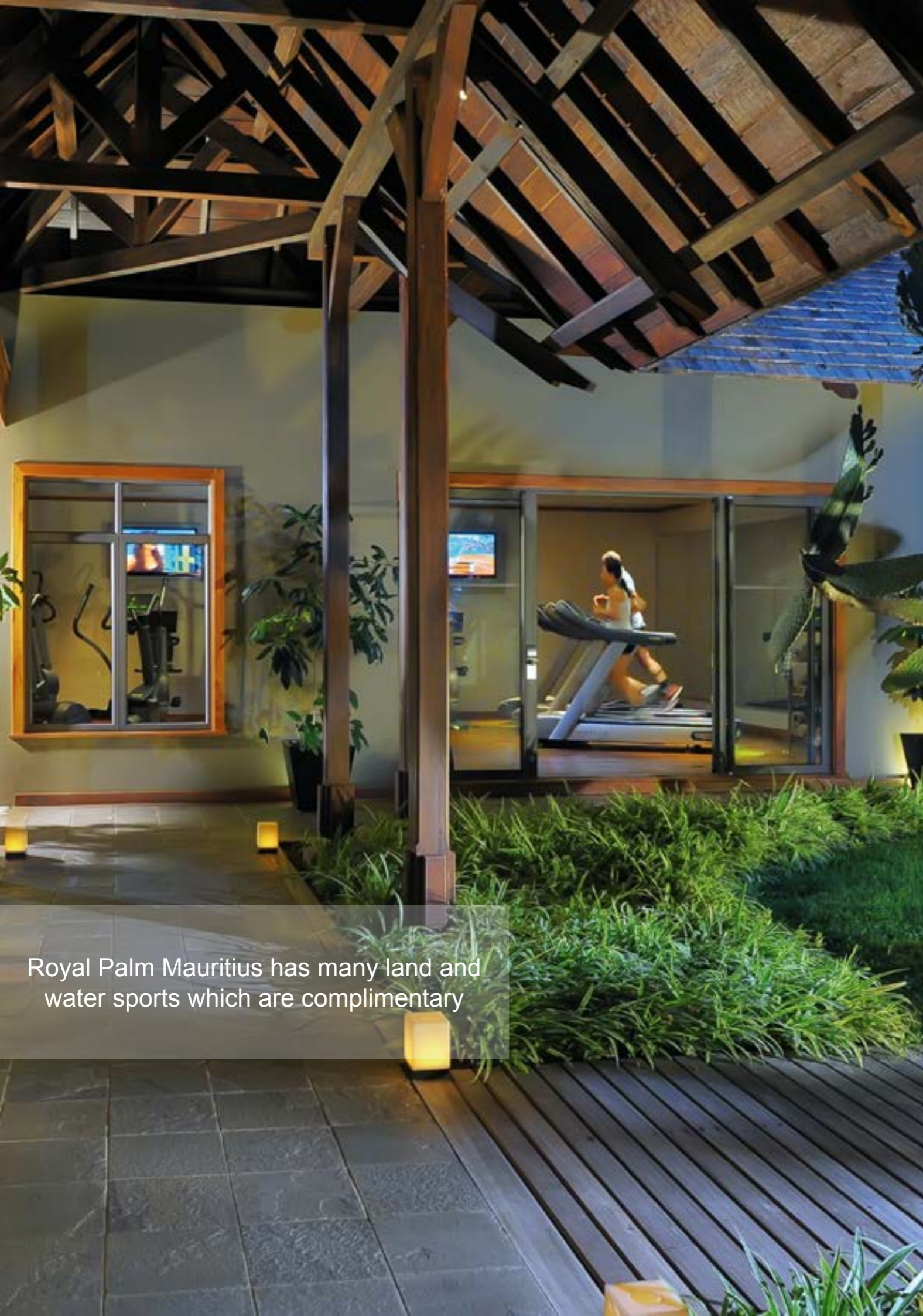
Royal Palm Mauritius has many land and water sports which are complimentary