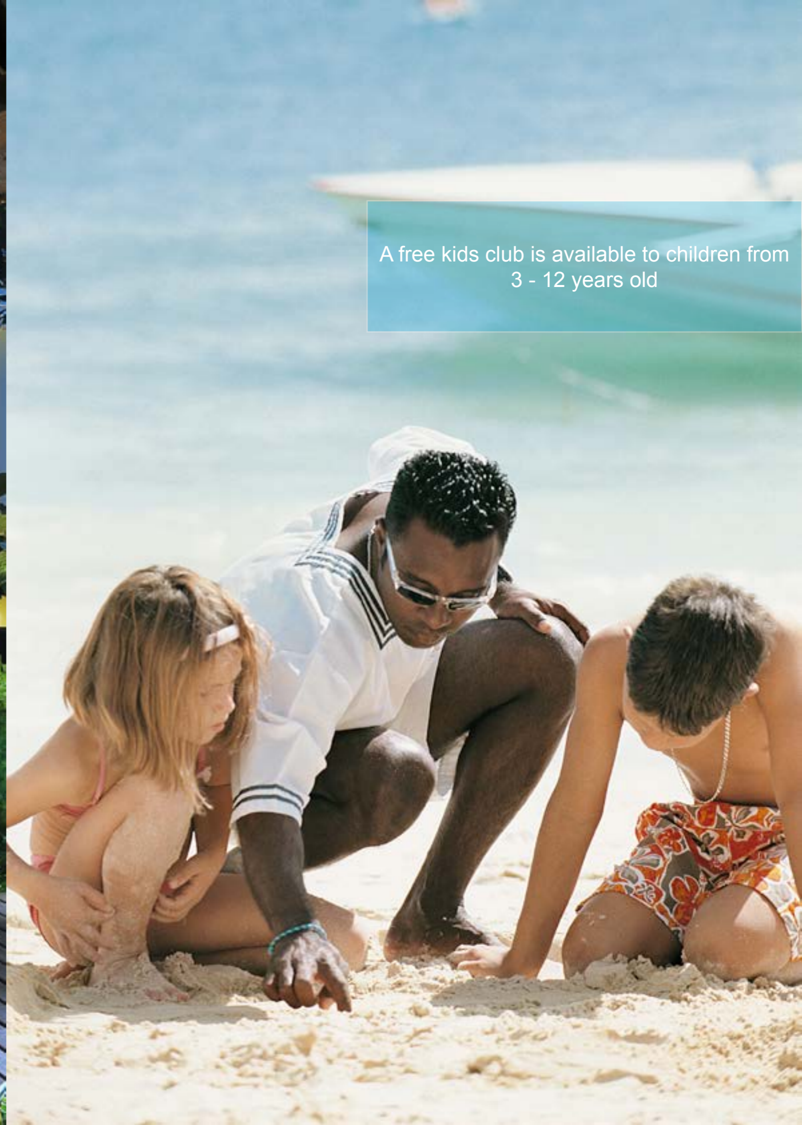
A free kids club is available to children from 3 - 12 years old