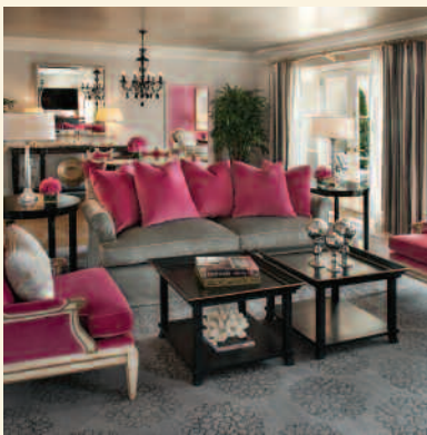
The Grand Deluxe Suite Living Room