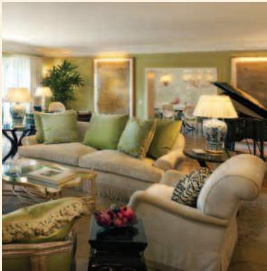
The Peninsula Suite Living Room