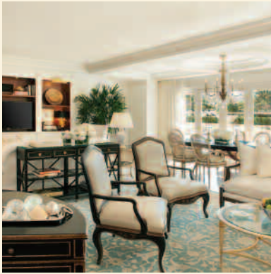
The Royal Patio Suite Living Room