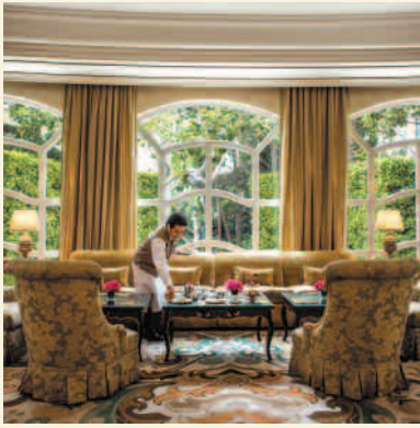
The Living Room