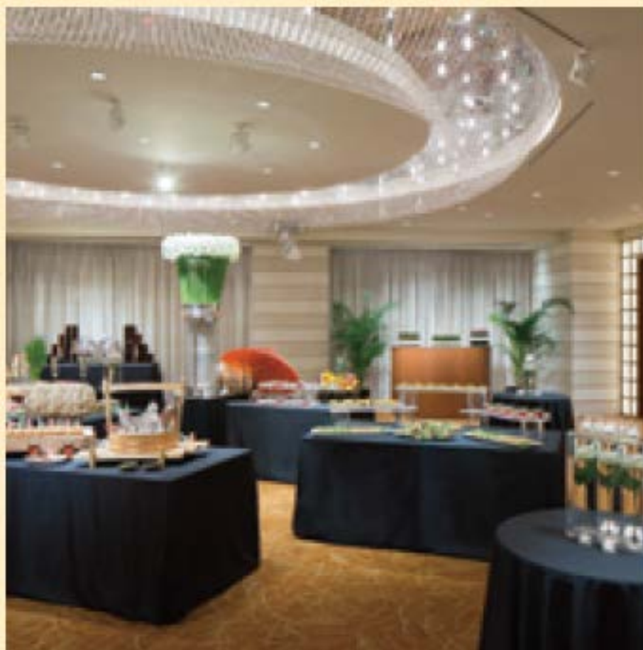
The Ginza Ballroom