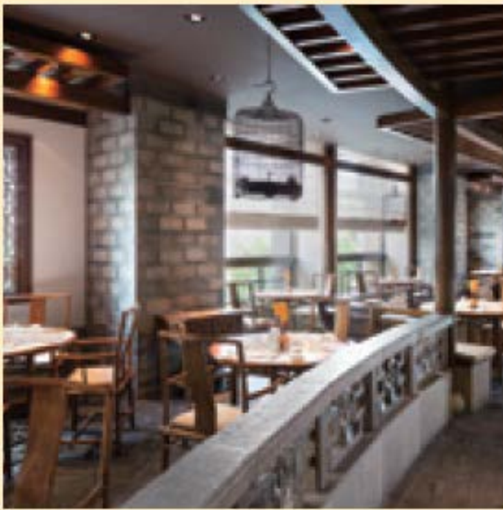
Hei Fung Terrace