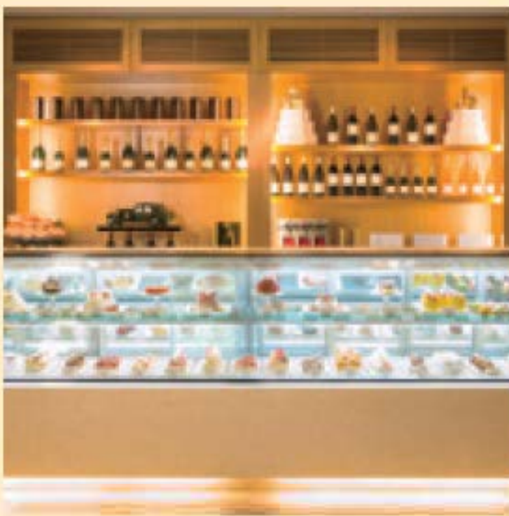
The Peninsula Boutique & Cafe

Tel: 03 6270 2731 Breakfast: 6:30 am - 11:00 am Lunch: 11:30 am - 2:30 pm Afternoon Tea: 2:30 pm - 5:00 pm Dinner: 6:00 pm - 10:00 pm Cocktails: 10:00 pm - 11:00 pm (Sunday- Thursday) 10:00 pm - 12:00 midnight (Friday- Saturday) Dress Code: Casual (tank tops and beach sandals not permitted)