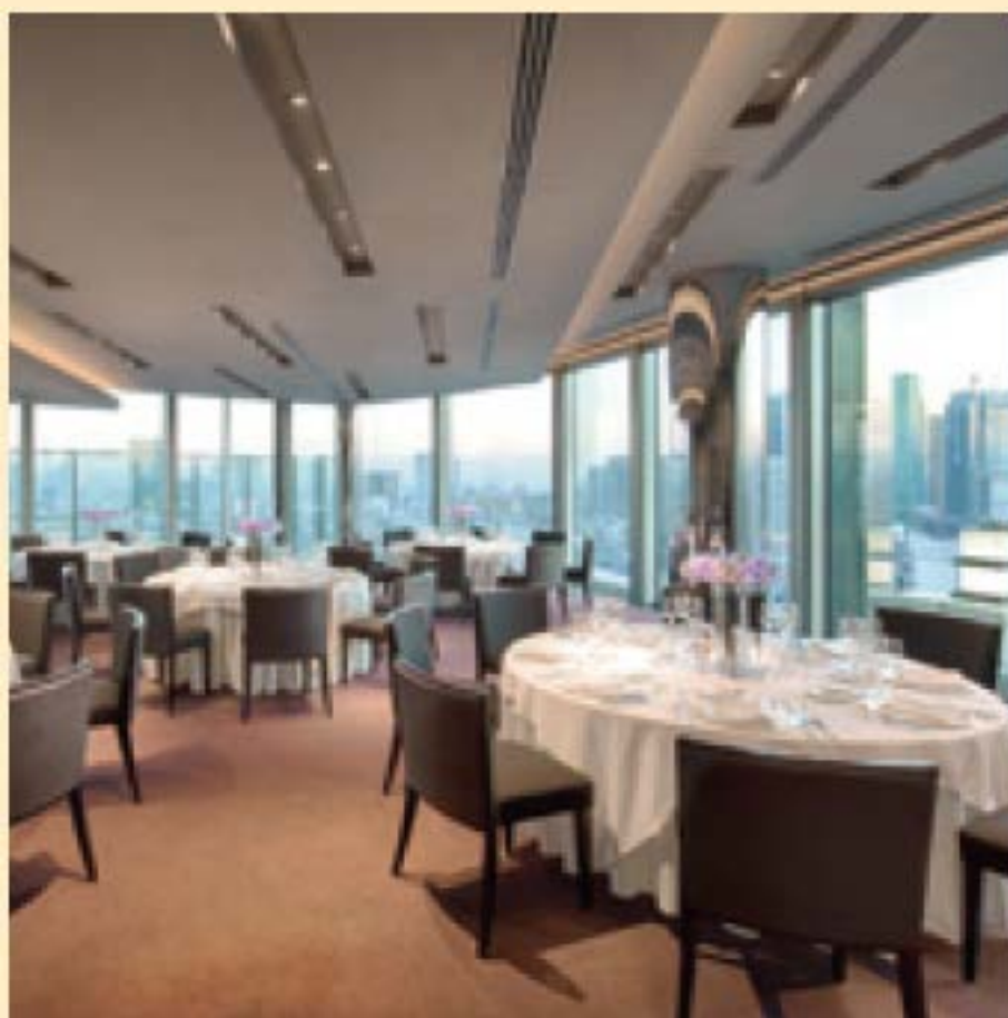
The Sky Room