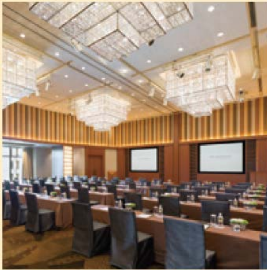
The Grand Ballroom