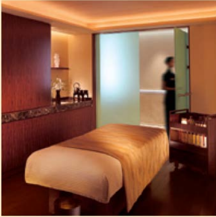
The Peninsula Spa