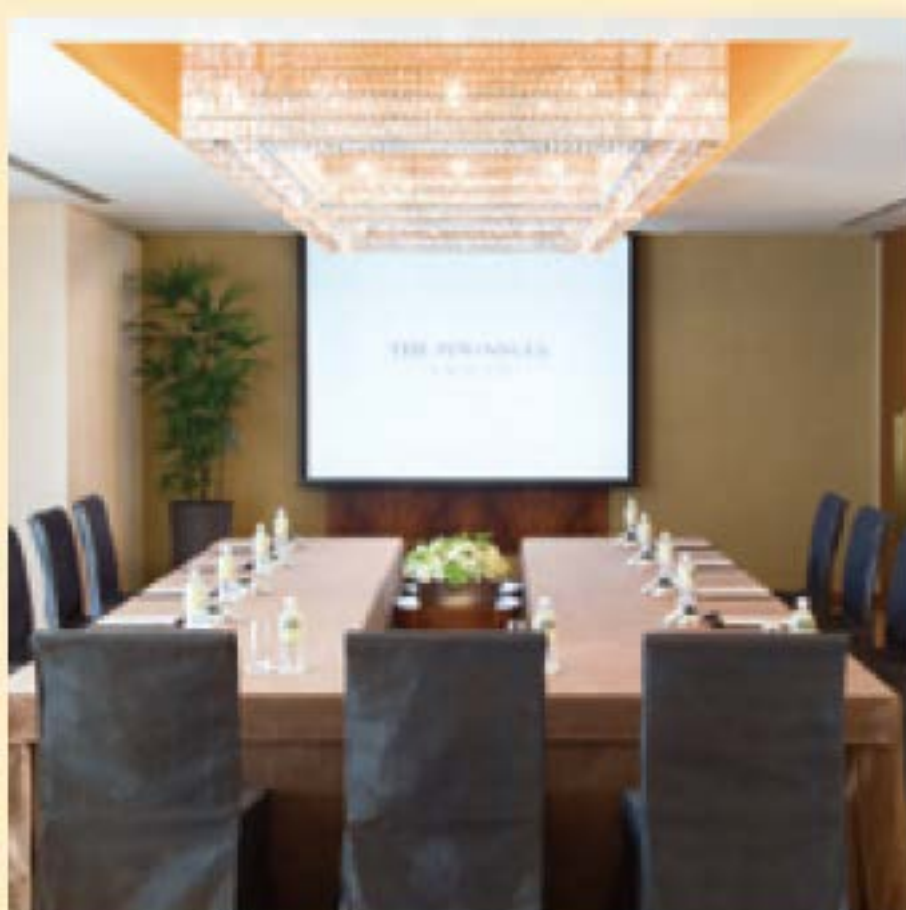
The Majestic Room