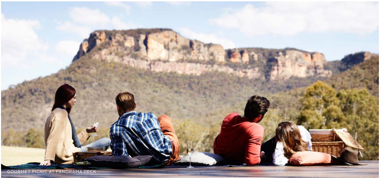
GOURMET PICNIC AT PANORAMA DECK