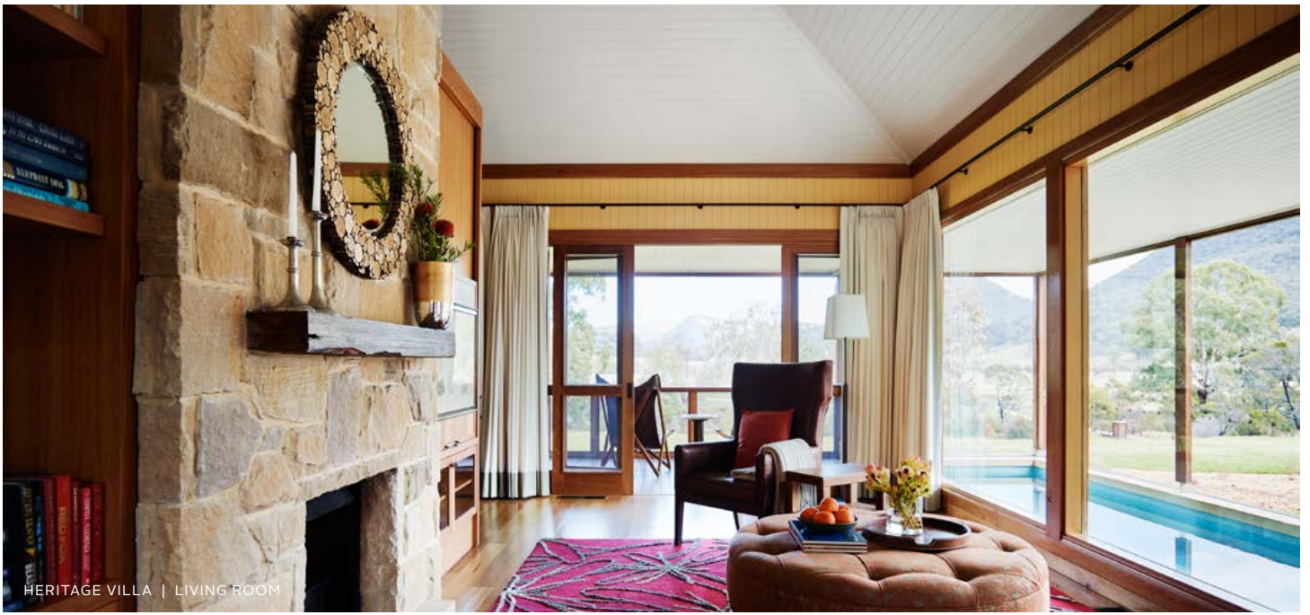
HERITAGE VILLA | LIVING ROOM