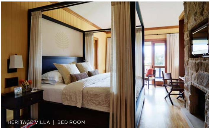
HERITAGE VILLA | BED ROOM